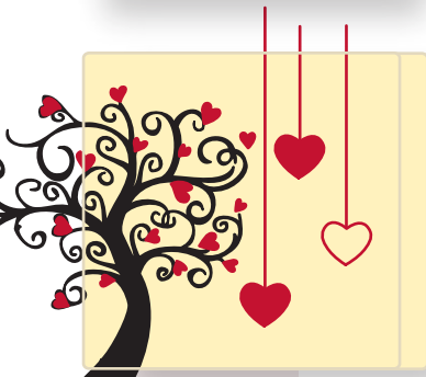
Tree of Love