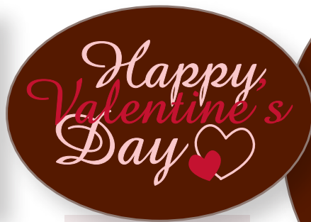
H Valentine's Day